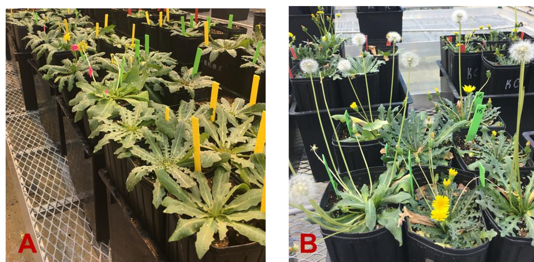
Figure 3. A) F1 direct seeded plants in treepots in the greenhouse. B) F1 transplants flowering and producing F2 seed.