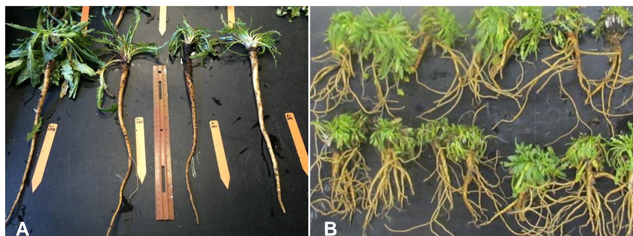
Figure 1. TK plants displaying A) taproot and B) multi-root phenotype.

Taraxacum kok-saghyz (TK) is under development in Ohio as a domestic natural rubber (NR) crop, to protect U.S. supplies, stabilize global prices, and supplement the tropically-produced NR from the rubber tree. TK plants have several natural root phenotypes or architectures: a taproot with no branching (Fig. 1A), a multiple root system where 2, 3, 4 or more roots develop from the crown (Fig. 1B), and also a taproot phenotype that develops branched roots toward the middle or tip (Fig. 2). Substantial losses in rubber yield occur during harvest as small roots are broken off and lost. This occurs in all harvest methods tested, including hand-digging plants from loose soil in raised beds, manual harvests using shovels in the field, and larger machine-driven field harvests. Rubber concentration is independent of root size [1] but its relationship to root architecture has not yet been investigated.