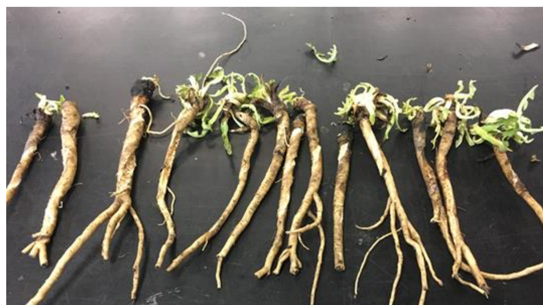
Figure 2. TK plants displaying taproots with distal branching.